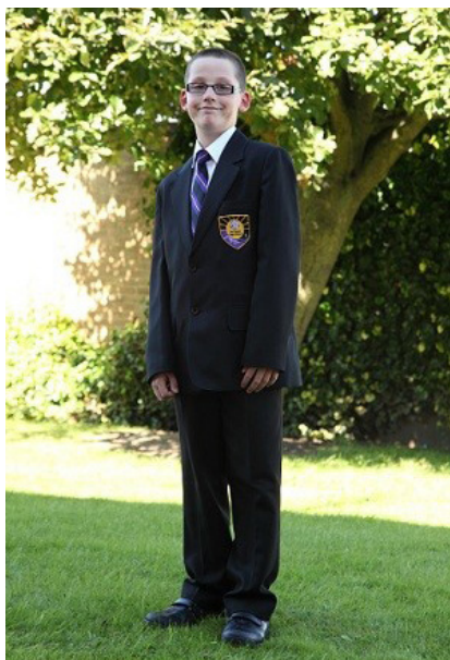
(Above) HHS Uniform

All items of school uniform are available from: Rawcliffes Schoolwear Centre: East Parade, Harrogate (Tel: 01423 504130). The shop is open from 9.00 to 5.30 Monday to Saturday.