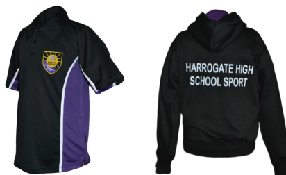
(Above) PE Uniform