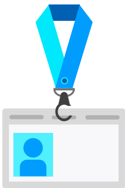
Blue HHS Staff